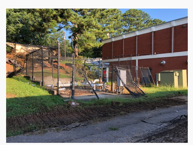
Removal of chiller for salvage