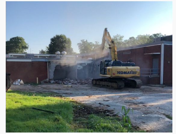
Demolition of kitchen