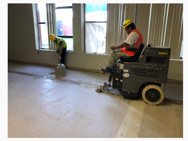
Removal of flooring in classroom building